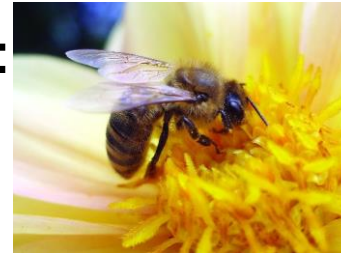
včela kranska carniola bee